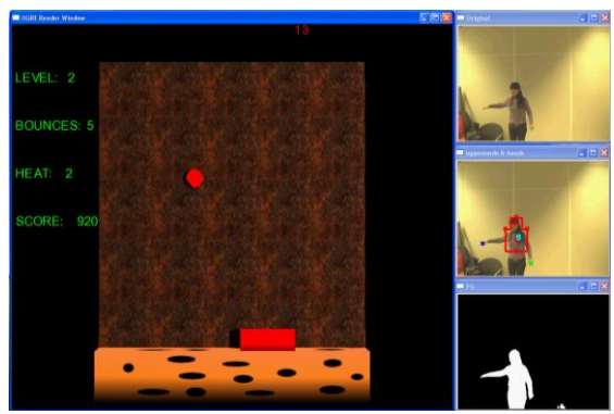
Fig .2. Spatial game interface. On the left side is the interface of the game, which shows the level, bounces, heat and score of the player. The three windows on the right side are the results from vision-based analysis. From top to bottom, they are original image, results from body parts segmentation and pose recognition, and foreground binary image.