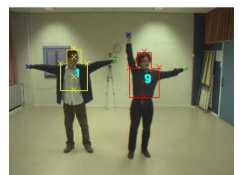
Fig.1. Results from people segmentation and pose recognition.

In Phong the player controls a bat which has to bounce off photons, see Fig.2. The position of the bat is determined by the player's position in front of the camera. The photons can have 6 different colors: red, blue, green, yellow, cyan and magenta. The bat can change into each of these colors when the player adopts the appropriate pose. The pose recognition system sends two types of data to the spatial game in every time step. It sends an integer that represents a pose (1-9) and an integer representing the 1D-location of the player. Fig.2 gives a screen shot of user playing the game. On the left side is the interface of the game, which shows the level, bounces, heat and score of the player. The three windows on the right side are the results from vision-based analysis. From top to bottom, they are original image, results from body parts segmentation and pose recognition, and foreground binary image. This pose-driven spatial game is a real time man-machine interaction without obtrusive sensors. It shows the possibility of a new way of interactions in novel computer games and entertainment. The combination of computer vision research and a practical application is quite useful. It allows us to directly test if the proposed algorithm satisfies certain requirements, in a specific application environment.